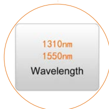
Multi-wavelength testing and display