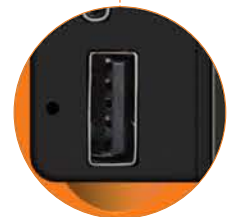
10400mAh power bank